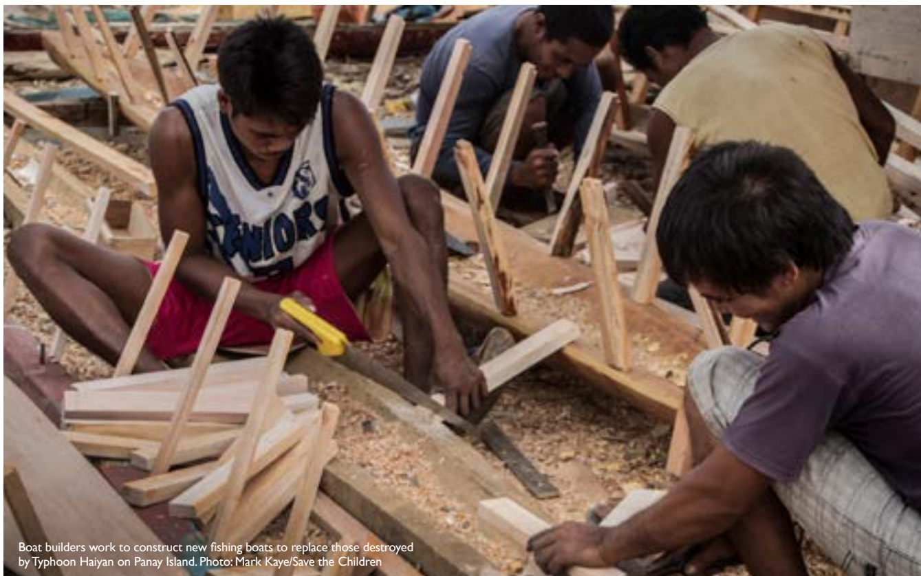
Boat builders work to construct new fishing boats to replace those destroyed by Typhoon Haiyan on Panay Island.