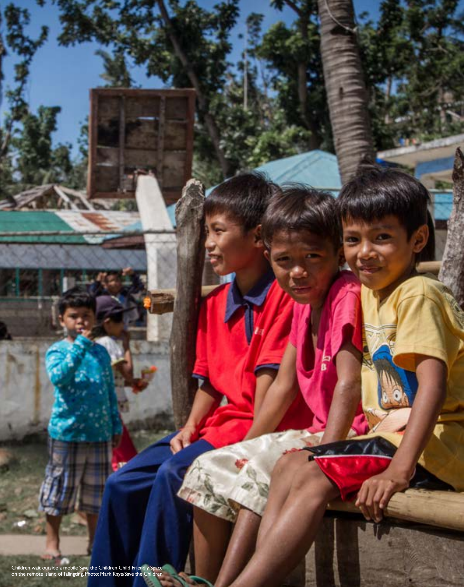
Children wait outside a mobile Save the Children Child Friendly Space on the remote island of Talingting.